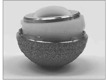
Figure 2 (10° insert shown)

Locking of the Trident® Constrained Acetabular Insert into the appropriately sized Trident® metal