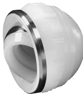
Trident® 10° Constrained Acetabular Insert