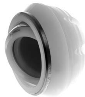
Trident® 0° All-Poly Constrained Acetabular Insert