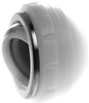
Trident® 0° Constrained Acetabular Insert