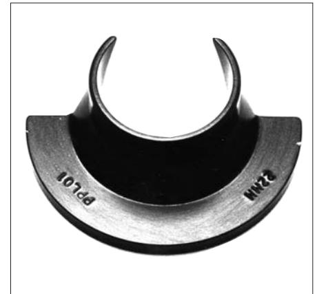
Figure 6 Head Removal Key

Removal of the constrained acetabular cup insert, if necessary, may be accomplished using a 3.3mm drill bit and a self-tapping bone screw with 3.4mm or higher major thread diameter