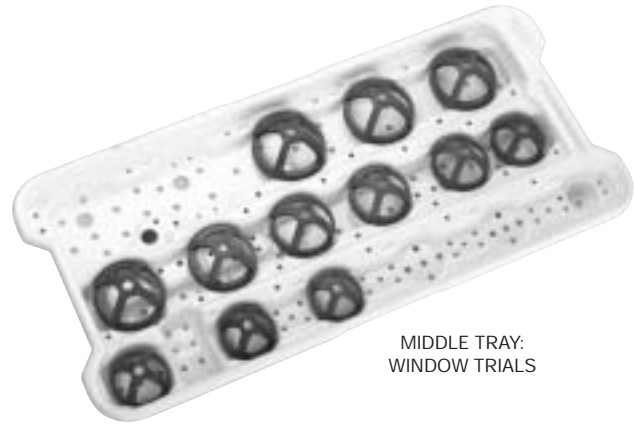
MIDDLE TRAY: WINDOW TRIALS